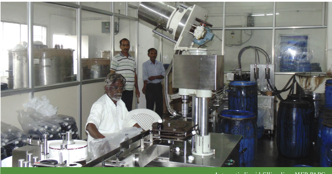
Automatic liquid filling line, MFP-PARC